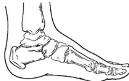
Normal pediatric foot